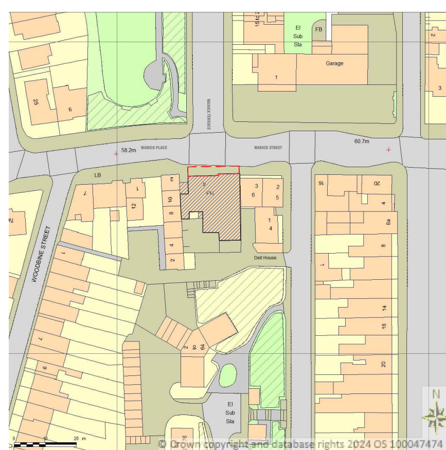
02 LOCATION PLAN SCALE 1:1250 @A1

Drawing issued on condition it is not copied in whole or part without consent. Figured dimensions take precedent over scaled. All dimensions to be checked on site prior to commencement of any work or shop drawings. To be read in conjunction with specification where relevant. All drawings to be read in conjunction with Structural Engineer's details & any relevant sub-contractors details. All works to comply with current Building Regulations, British Standards & Codes of Practice. Contractor to ensure that all work meets the requirements of the EHD, Building Control, Fire Authority and all other statutory bodies. Any issues regarding the above contact BARK! at the above contact information and address.