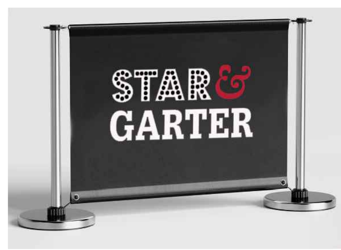
04 CAFE BARRIER TYPE SCALE NTS