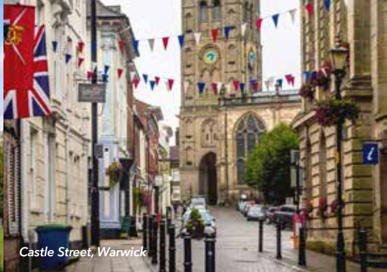
Castle Street, Warwick