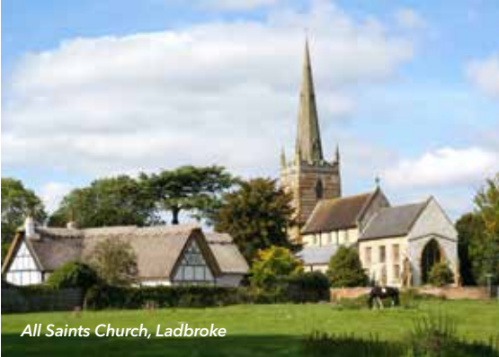
All Saints Church, Ladbroke