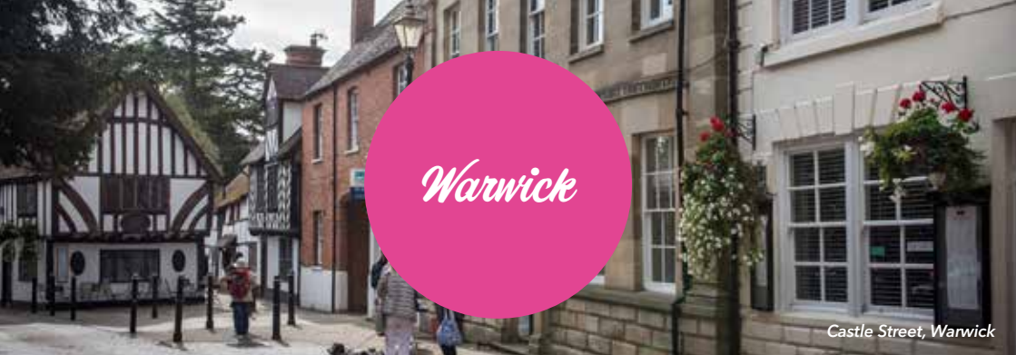
Castle Street, Warwick