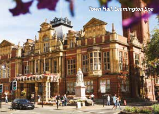
Town Hall, Leamington Spa